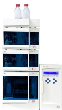
Fig. 1. ALEXYS Analyzer

RBL-2H3 cells (mast cell model) were used for a study at the University of Utrecht. The cells were exposed to DNP-BSA allergen and the release of histamine into the surrounding cell culture was measured. Samples were deproteinized with perchloric acid, followed by centrifugation. The